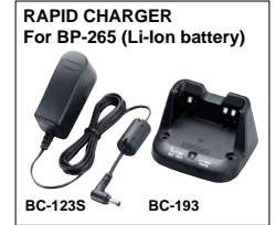
RAPID CHARGER For BP-265 (Li-Ion battery)