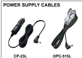
POWER SUPPLY CABLES