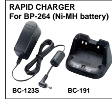
RAPID CHARGER For BP-264 (Ni-MH battery)