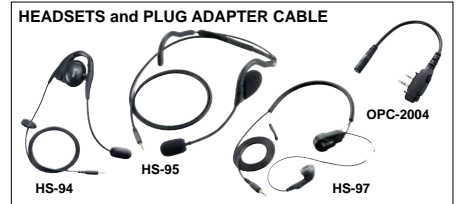
HEADSETS and PLUG ADAPTER CABLE