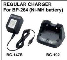
REGULAR CHARGER For BP-264 (Ni-MH battery)

*Tx: Rx: standby = 5:5:90. Power save function ON.