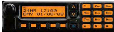
Internal clock setting example

With a high contrast dot matrix display, upper and lower case characters can be easily distinguished. The display shows 12 characters by 2 lines. LCD backlight is standard.