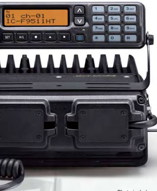
Photo includes optional RMK-4, OPC-607, SP-22, SP-30 and HM-148G.

The IC-F9511HT's RF (main) unit dimensions are only 175 (W) × 60 (H) × 279 (D) mm (6 \frac{7}{8} × 2 \frac{3}{8} × 10 \frac{31}{32} in), so the RF unit can be fit into a "letter size" console box.